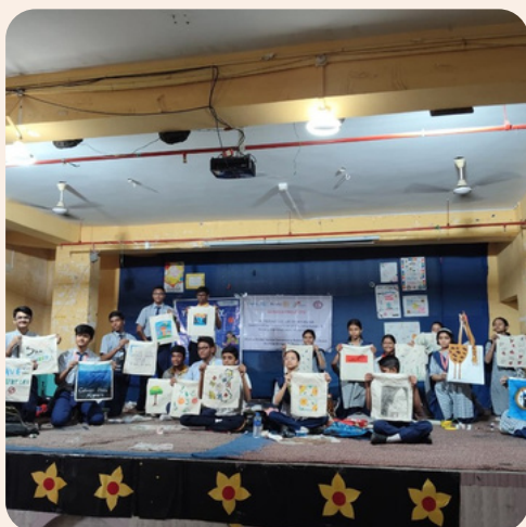
TOTE-ALLY AT KHALSA MODAL SCHOOL IN ASSOCIATION WITH DISTRICT INTERACT COUNCIL ON 20.03.25