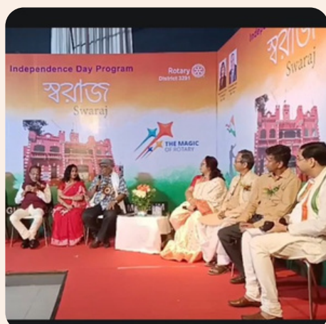
SWARAJ-DISTRICT EVENT 15.08.24