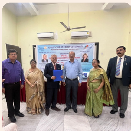
DISHA-NEW MEMBER'S ORIENTATION PROGRAM 03.08.24