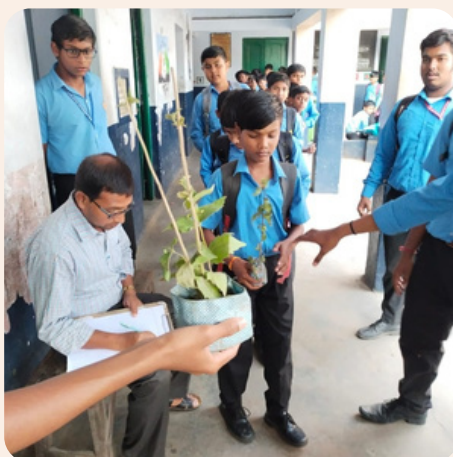
100 FLOWERING PLANT DISTRIBUTION AT NEW BARRACKPORE HIGH SCHOOL ON 24.02.25