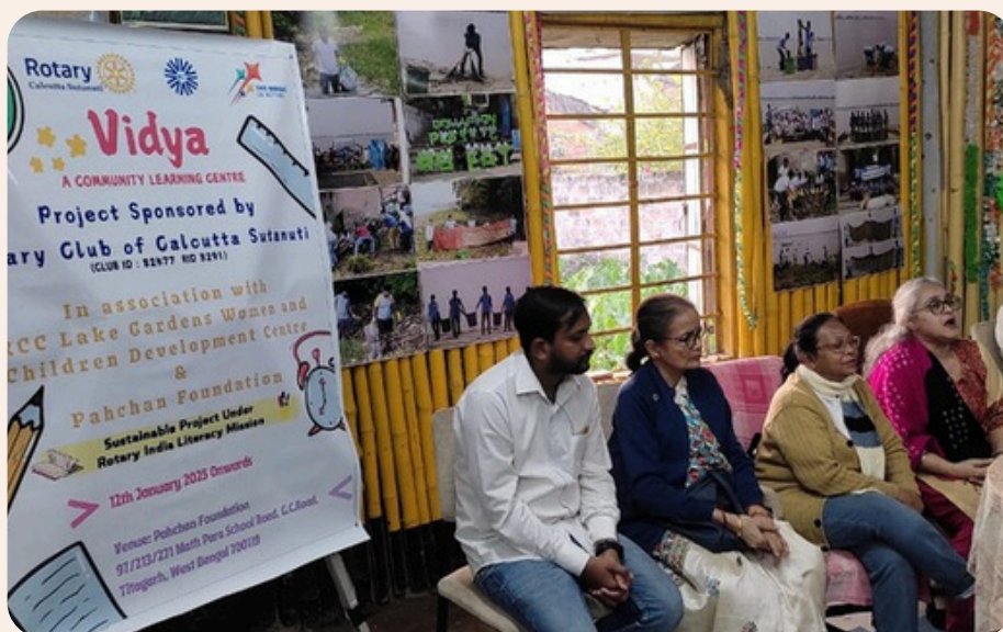
VIDYA- COMMUNITY ADULT LEARNING CENTRE IN ASSOCIATION WITH RCC LAKE GARDENS WDC & PEHCHAN FOUNDATION UNDER RILM ON 12.01.2025