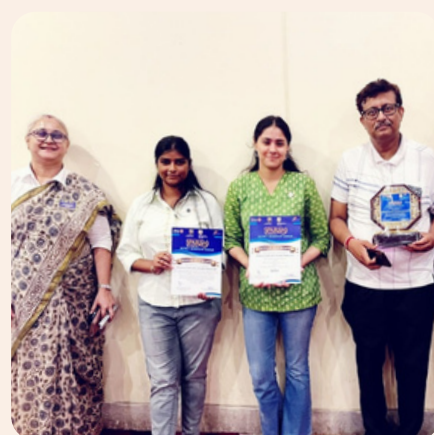
SPARSH-DISTRICT MEMBERSHIP SEMINAR (HOST CLUB) 31.08.24