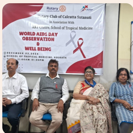
WORLD'S AIDS DAY OBSERVATION AT SCHOOL OF TROPICAL MEDICINE ON 02.12.24