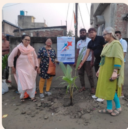
SAPLING PLANTATION WITH RCC LAKE GARDENS, WCDC & PEHCHAN FOUNDATION AT TITAGARH 19.10.24