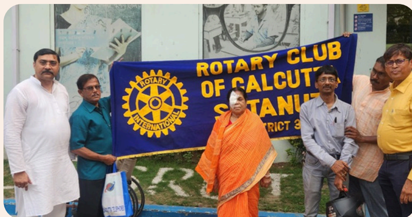
FREE EYE CHECKUP IN ASSOCIATION WITH SUSHRUT EYE FOUNDATION & RESEARCH CENTRE, NEW BARRACKPORE COLONY BOYS HIGH SCHOOL ON 19.04.25