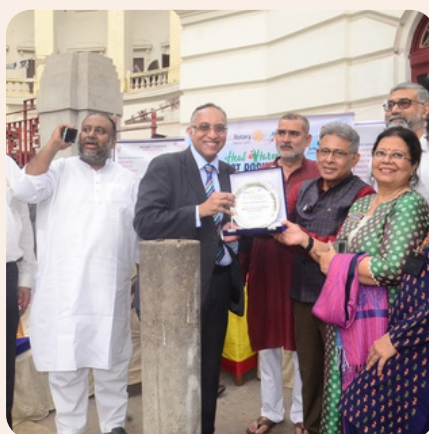
PROJECT POSITIVE HEALTH AT TIPU SULTAN MOSQUE ON 29.11.24