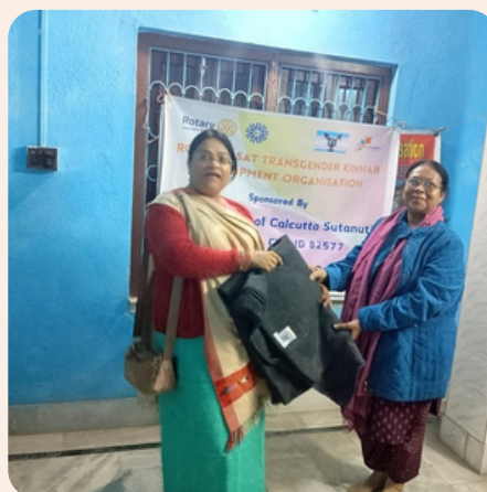
BLANKET DISTRIBUTION AT RCC BARASAT TRANSGENDER KINNAR DEVELOPMENT ORGANISATION ON 10.02.25