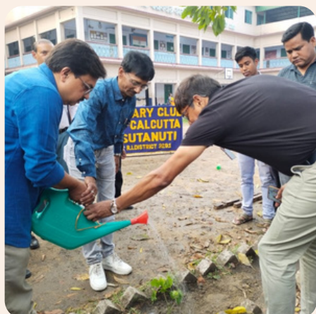
PLANTATION DRIVE AT NEW BARRACKPORE HIGH SCHOOL ON 19.02.25