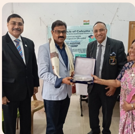
PROJECT POSITIVE HEALTH AT JUDGES COURT ALIPORE ON 19.12.2024