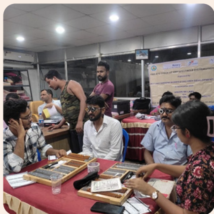
FREE EYE CHECKUP & SPECTACLE DISTRIBUTION AT AVG LOGISTICS 07.09.24