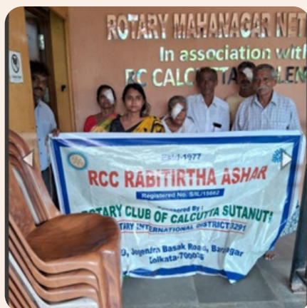
EYE CATARACT OPERATION 09.07.24