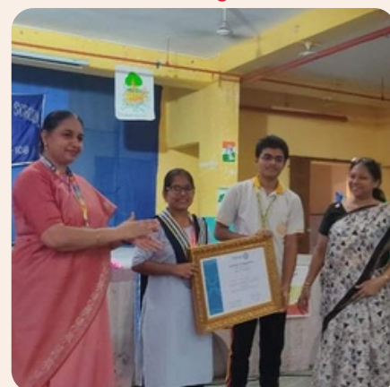
3RD INSTALLATION CEREMONY OF KHALSA INTERACT CLUB 02.08.24