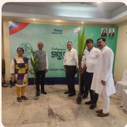
SABUJAYAN PHASE-I 01.09.24