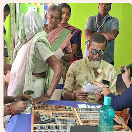
SPECTACLES DISTRIBUTION IN ASSOCIATION WITH RCCBAZAR PATHER DISHA & VISION RX LAB ON 06.12.24