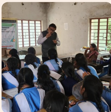
FINANCIAL LITERACY AT BALLY GIRLS HIGH SCHOOL ON 20.12.2024