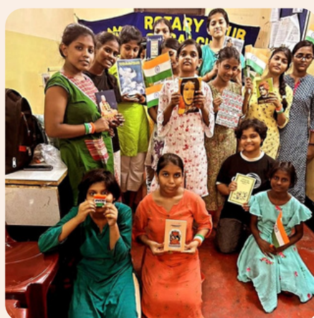
CELEBRATION AND BOOK DONATION AT KRITIKA PROTECTION HOME 15.08.24