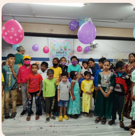
HOICHOI - CHILDREN'S DAY CELEBRATION AT SSKM HOSPITAL ON 23.11.24