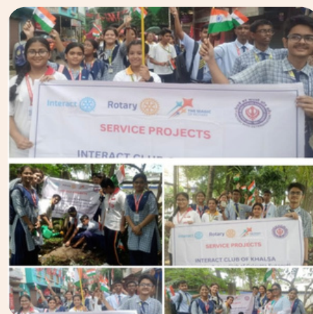
SAPLING PLANTATION AT KHALSA INTERACT CLUB 15.08.24