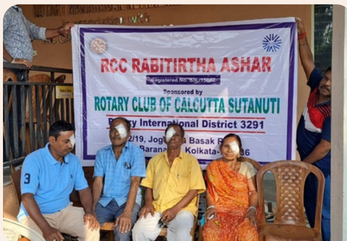
ILO SURGERY ON 12.05.25