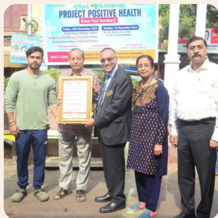
PROJECT POSITIVE HEALTH AT SANT KUTIYA GURUDWARA ON 29.11.24