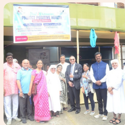
PROJECT POSITIVE HEALTH AT LITTLE SISTER'S OF POOR ON 1.12.24