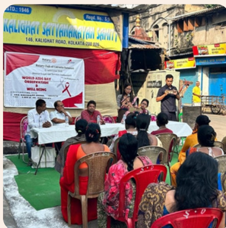
WORLD AIDS DAY OBSERVATION IN ASSOCIATION WITH DALSA ON 05.12.24