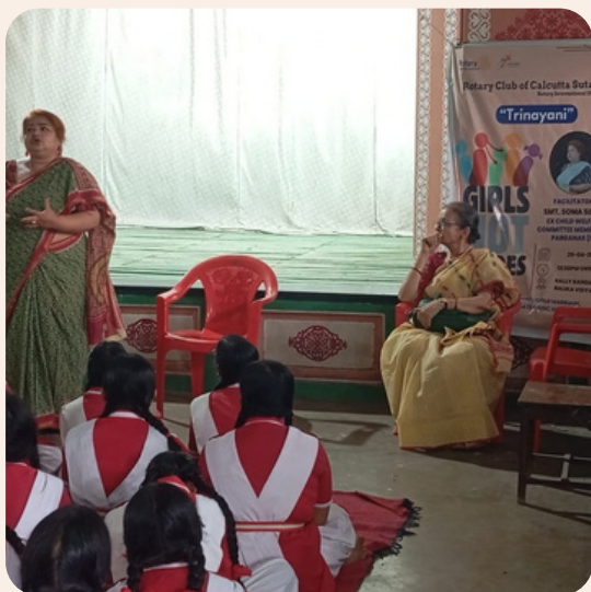
TRINAYANI - GIRLS NOT BRIDE, AT BALLY BANGA SISHU BALIKA VIDYALAYA ON 25.04.25