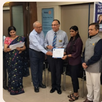
RLI PART I 07.09.24