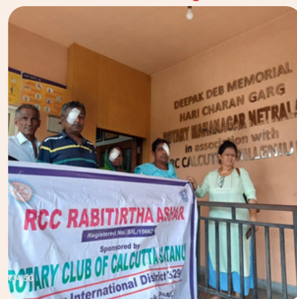
EYE CATARACT OPERATION