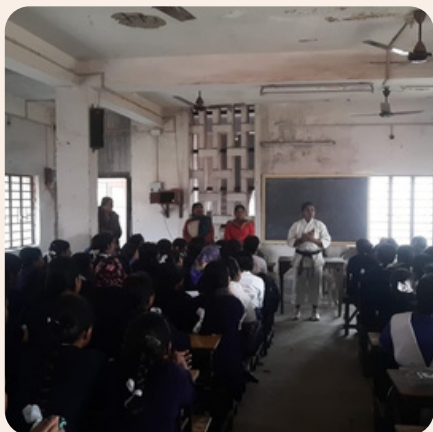
SELF DEFENCE - SHOKATAN AT BALLY GIRLS HIFG SCHOOL