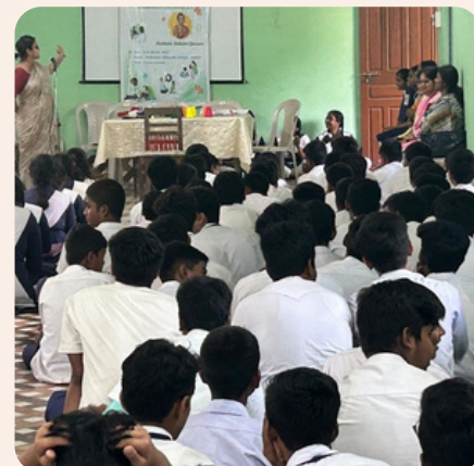
UCCHATON MON- MENTAL HEALTH AWARENESS AT PARBATIPAR VIDYAPATH ON 21.03.25