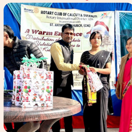
A WARM EMBRACE- DISTRIBUTION OF BLANKETS AND GIFTS AT ST. ANTHONY'S CHURCH, KALIMPONG ON 25.12.24