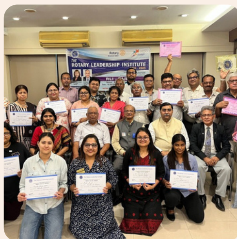
RLI PART II ON 12.04.25