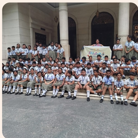
EASY SCHOOL 3- EDUCATIONAL TOUR TO BIRLA PLANETORIUM 04.10.24