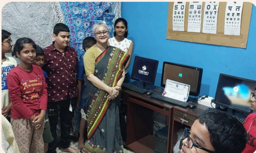
COMPUTER TRAINING CENTRE INAUGURATED AT RCC RABINDRATIRTHA ASHAR ON 15.04.25