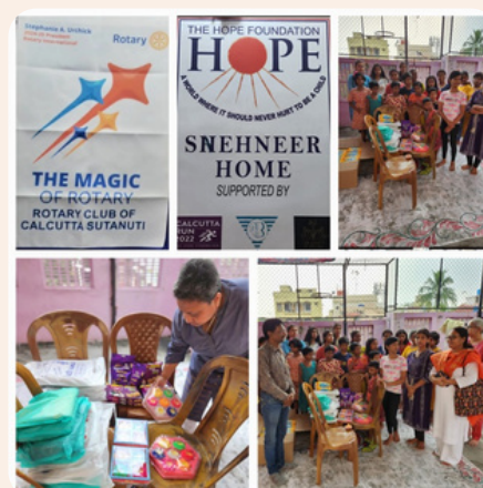
DIWALI CELEBRATION AT SNEHANEER HOME AT BAGUIHATI WITH 21 INMATE GIRLS 29.10.24