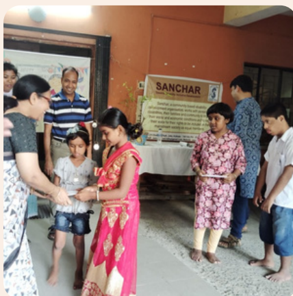
EASY SCHOOL 3- CELEBRATION AT SANCHAAAR 05.09.24